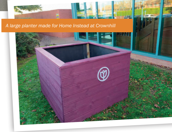
A large planter made for Home Instead at Crownhill

"Anyone who is looking to spend their time productively and perhaps to contribute to our