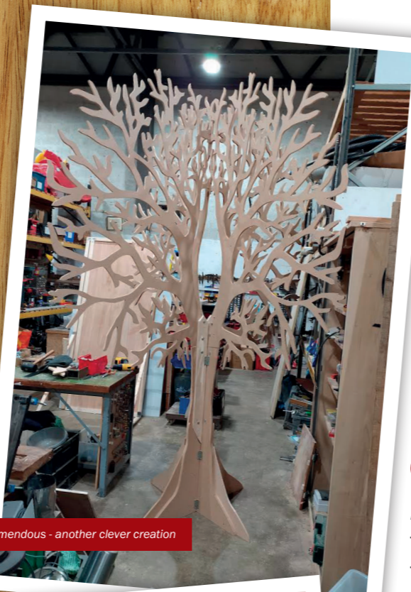
Tree-mendous - another clever creation