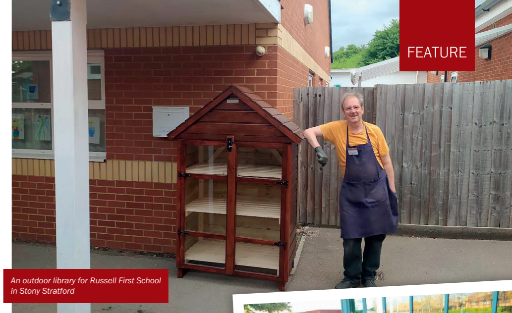
An outdoor library for Russell First School in Stony Stratford

“Anyone who is looking to spend their time productively and perhaps to contribute to our community projects is welcome to join...”