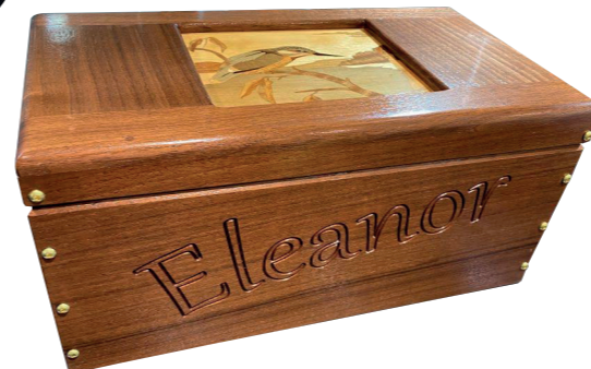
From the left: Replica music stand for local band The Rhythm Aces, 'Ears' a Mickey Mouse bird box made by MiS and an engraved ornamental box

Garden, made a treasure chest for an Easter challenge in Stony Stratford, and their replica music stand for The Rhythm Aces – a band active in the area from the 1940s – took pride of place at the 2021 Wired For Sound exhibition.